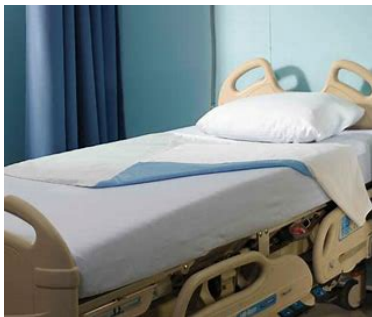
Standard: 40” x 72”