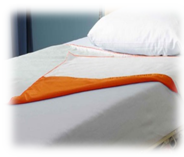
Stretcher: 40” x 54”